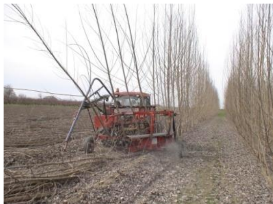
Figure 3. Spapperi felling-windrowing machine during poplar harvesting

Combined to the unloading device, there is a chain (14-toothed) that, rotating at a speed faster than that of the tractor, has the function of, facilitating the collapse of the trees in the opposite direction to the advancing direction of the machine. The chain, which has 56 double pitches, is placed at 2005 mm from the ground and rotates around the ring gear (10-toothed), for a working length of 135 mm.