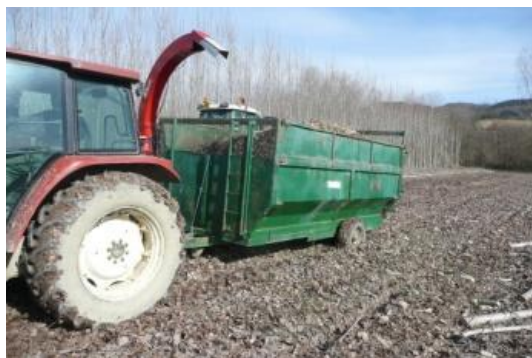
Figure 1. Due to the chip weight and ground conditions, the trailer wheels sink in the ground

The second system, presented in this paper, requires the use of the light felling machine during the winter; the introduction of the heavy chipping machine and tractor trailers onto the field is postponed until April or May, when the ground permit the passage of the machine without any consequences for the compaction of the soil. In fact, during the winter rainy periods can make the fields unworkable for long period, therefore the number of days effective for the harvesting using choppers can be not sufficient. Thus a felling machine that is lighter than other machines and postpone the chipping phase when the ground is dry can be a solution for lower compaction of the soil (Fig. 1).