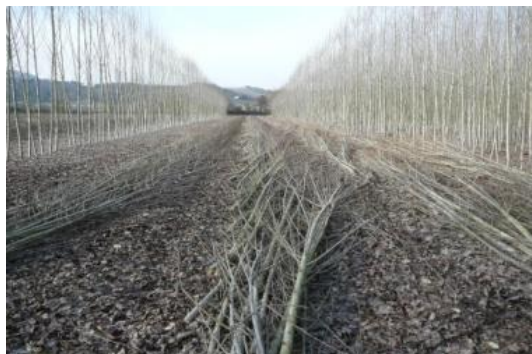
Figure 7. Windrows harvested by mower chopper and loader equipped with pick-up