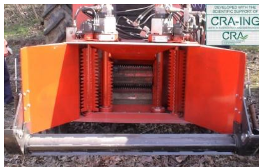
Figure 5. Spapperi mod. RT mower chopper and loader with rotating pick-up for harvesting windrowed plants by two devices for self-levelling on the sides, two conveyor vertical rolls and horizontal rolls to feed chipper.

The rotation movement of the pick-up originates from a hydraulic pump placed on the left side. A valve can adjust the rotation speed according to the advancing speed of the machine as well as the quantity of biomass on the ground. A “idle” self-levelling system was mounted on both sides of the pick-up in order to guarantee contact between the gathering device and the ground. The conveyor device was extended by a new funnel-shaped instrument (width = 1750 mm) aimed at orientating the basal parts of the plants that are not perfectly aligned in the centre of inter-row towards the chipper supply system.