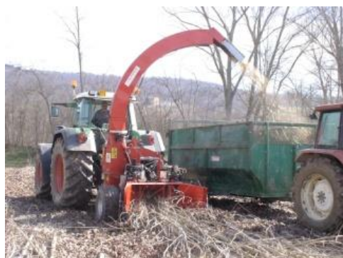
Figure 4. Spapperi mower chopper and loader mod. RT during windrows harvesting

The gathering device was made up of a cylindrical-shaped and rotating pick-up (diameter = 110 mm and length = 1690 mm) provided with four steel bars (thickness = 10 mm and height = 30 mm) aimed at taking and lifting the basal part of plants. Its rotation axis is spaced 540 mm away from the chipper supply system (with a 465 mm space for discharging probable extraneous materials (Fig. 5).