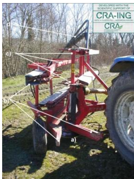
Figure 2. specifications of the cutting (a), conveyor (b), transport (c) and unload (d)

The machine has a total mass of 1,000 kg and outside side play of 3,060 mm when it is working, and it mounts a set of cutting, conveyor and transporting devices (in addition to devices serving to orient plants towards the inter-row) on a metal structure (Fig. 2, specifically a, b, c and d).