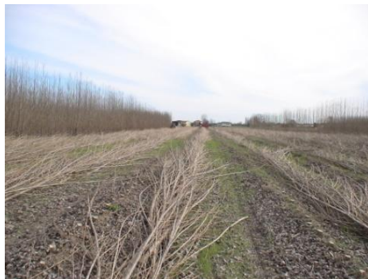
Figure 8. Positioning of the cut by felling-windrowing machine

The windrows were regular and parallel to the advancing direction of the machine (Fig. 8). In this way, subsequently, correct harvesting and chipping will be possible. Product losses represented 1.97% of the cut-windrowed product, whereas the cut height was between 60 and 68 mm.