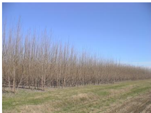
Figure 6. Single rows planting of two years and two years stalks made up of AF2 clone

The felling and windrowing proof were conducted close to a poplar plantation of second-year growth (R2S2: Roots 2 years – Stalks 2 years) of AF2 clones (Fig. 6).