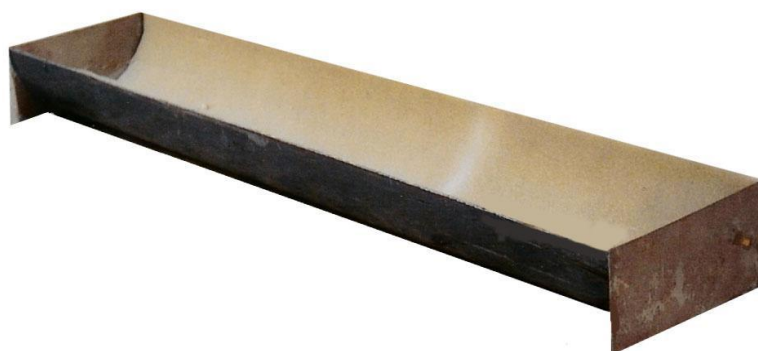
Fig. 1. Tray for catching seed --- 544 mm long by 115 mm wide with a 'u' section, made of polyetylen ; the tray was inserted between, and held upright by, the canola stems

Note: Means followed by the same letters within columns do not differ at ( p \leq 0.05 ) level of probability.